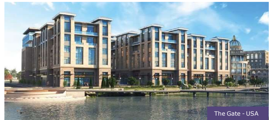
The Gate - USA

Today, an expanded and impressive portfolio of premium properties, which includes some of the most sought-after properties by meticulous clients worldwide, serve as a testament to IGO's well-deserved reputation as one of the top regional investment companies.