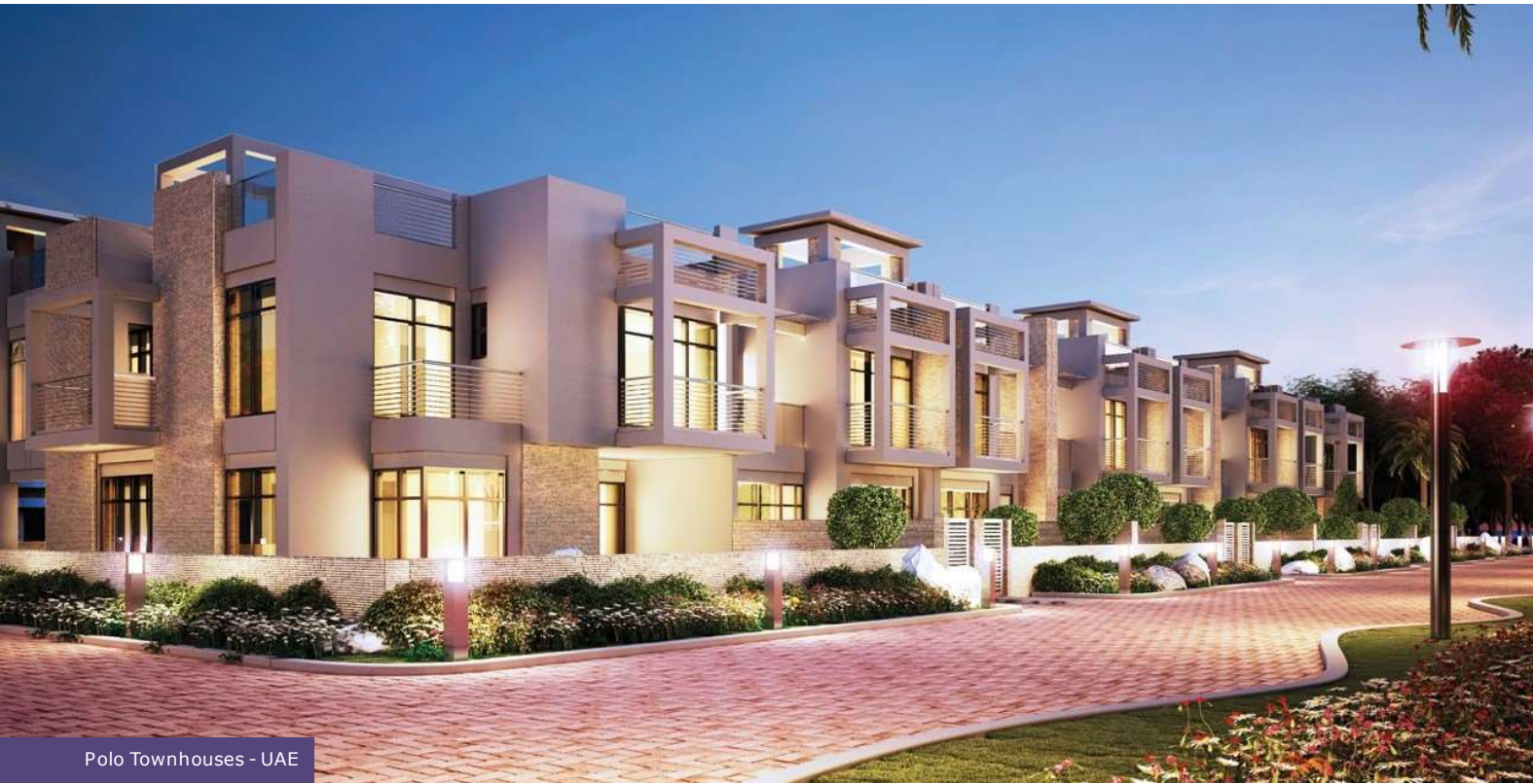
Polo Townhouses - UAE